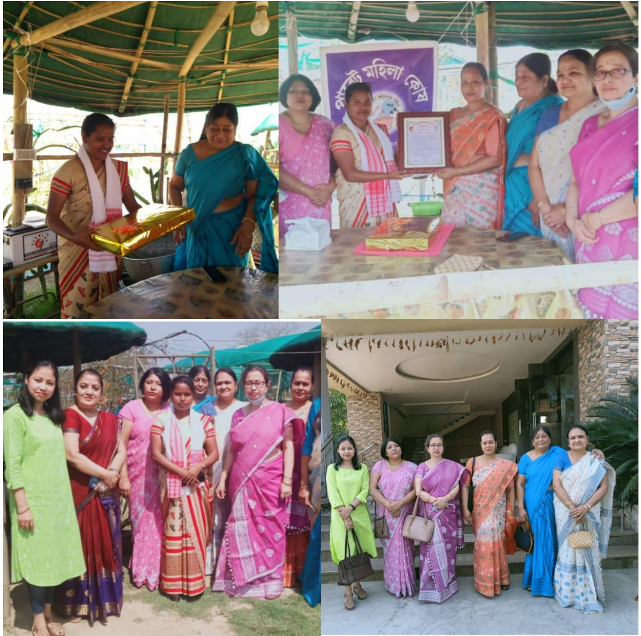
Fig.2: Celebration of International Women's Day on 8 th March, 2022