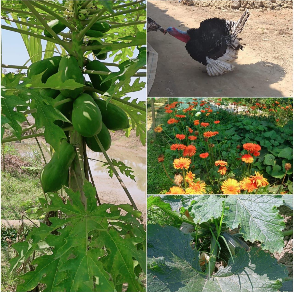
Fig.3: Few snapshots of vegetables and seasonal flowers growing in the farm in organic manner